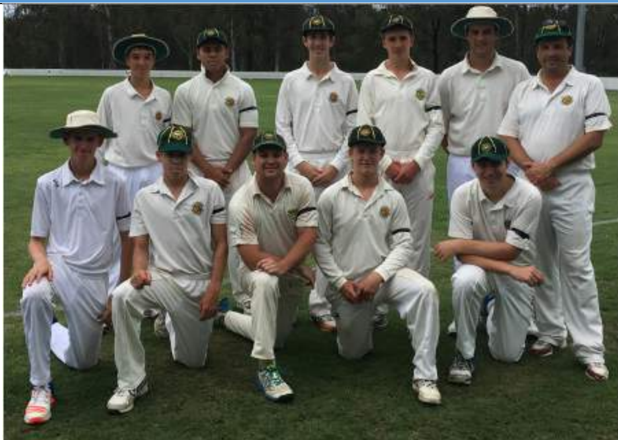
Fifth Grade with black arm bands for Lance Roudenko's father who passed away the previous week.