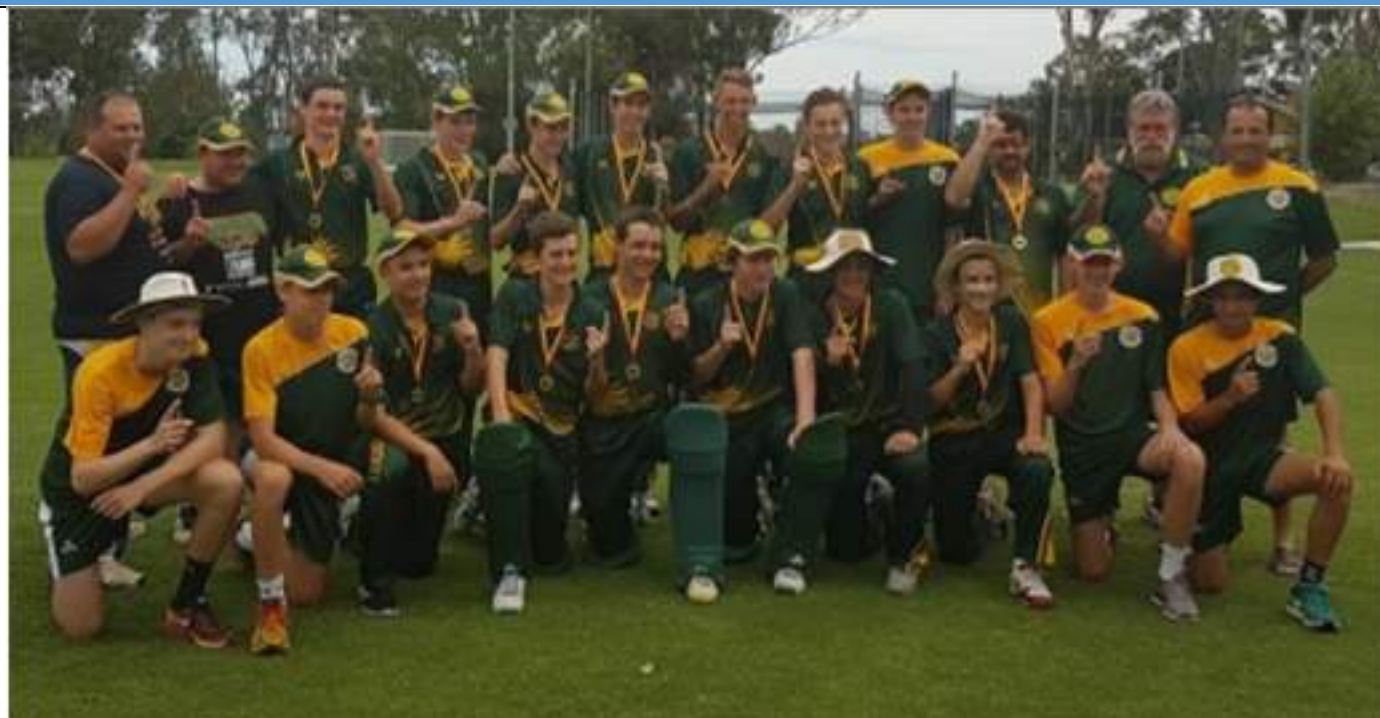
The winning Tav's squad fresh after their win against the Gold Coast.