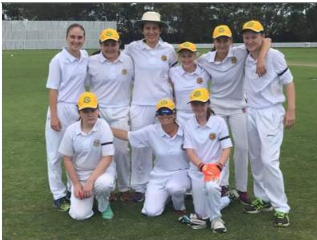
Our Women's team continues to make our club proud.